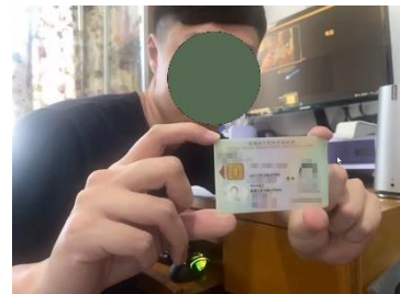
Holding your Identity card